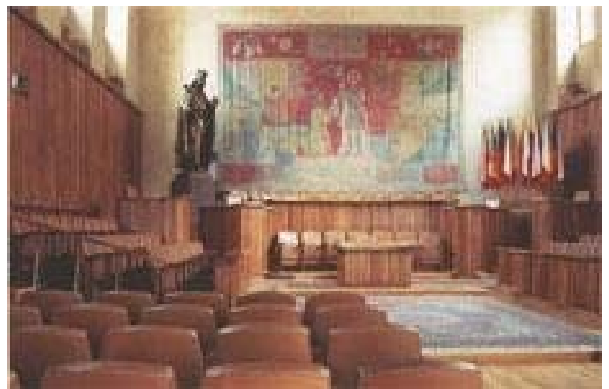
Karolinum hall at Charles University in Prague

Its objective is to give an overview of the state of art as well as upcoming trends, and to promote discussion about the potentials and limitations of the new learning and training technologies in both the academic and the corporate sector. The Conference and all connected activities will take place in the medieval palaces of Charles University in Prague, called Karolinum.