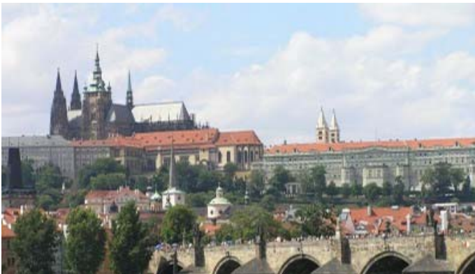
Charles Bridge and Prague Castle

Papers are due 15 February. Registration will begin at the end of June—see the website for all dates and detail.