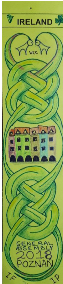
Drawn by Declan Brady