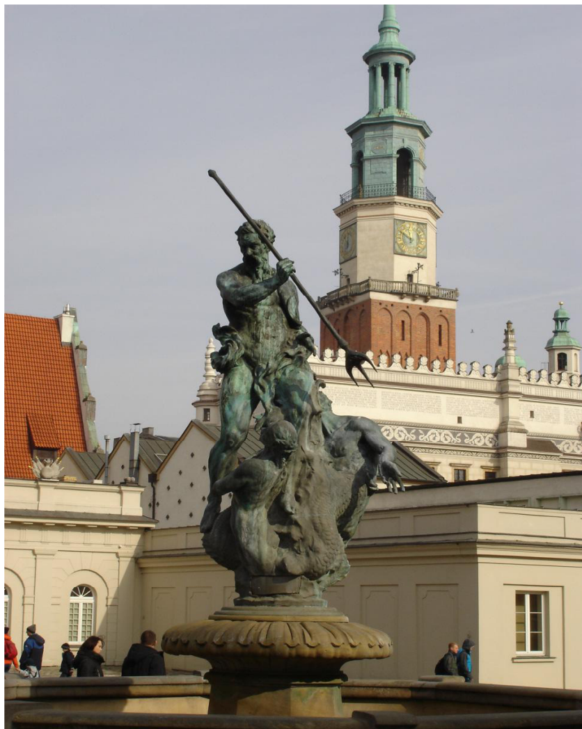
Old Market, Poznan